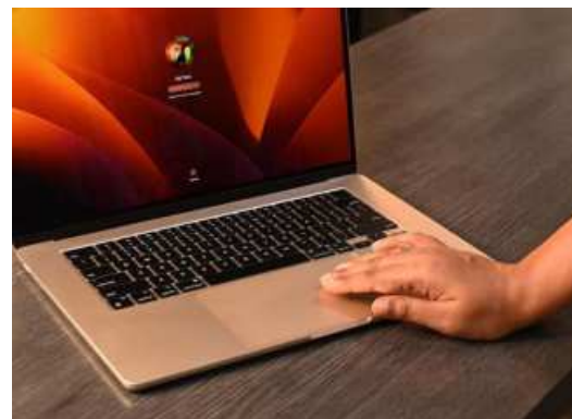
MEDIA MARATHONER. With seemingly endless battery life, the new MacBook Air is a great companion for long hours of work and play