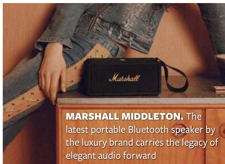
MARSHALL MIDDLETON. The latest portable Bluetooth speaker by the luxury brand carries the legacy of elegant audio forward

PAIRING Pairing the Middleton via Bluetooth and the app was easy enough. The