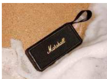
The speaker is protected against limited exposure to water

BATTERY Marshall claims that the Middleton can keep crooning for 20+ hours on a single charge cycle. In my experience it came close to that timeline. It takes a fair bit of time to go from zero to full though, almost 4-5 hours. But, this doesn't get in the way of the speaker being used in the meantime. In case you already have a Middleton or are planning to buy multiples, you